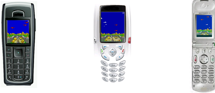
Fig. 1. Platform variation of the GM game

refactoring the original code to extract variation, extensive use is made of Extract Method. However, no refactoring is performed when the variation is scattered. At this point, we create an empty aspect to which we map the extracted variation. The precise mapping depends on the variation type and whether the variation is scattered or not. Table 1 defines this mapping.